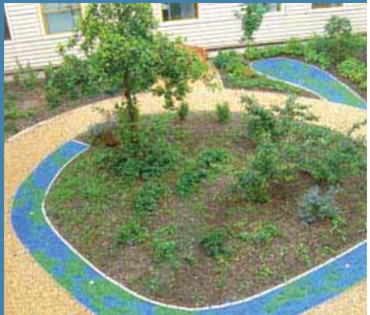
The finished project

Groups of offenders on Community Payback spent nine months clearing and helping artists create two beautiful courtyard gardens for patients, visitors and staff to enjoy.