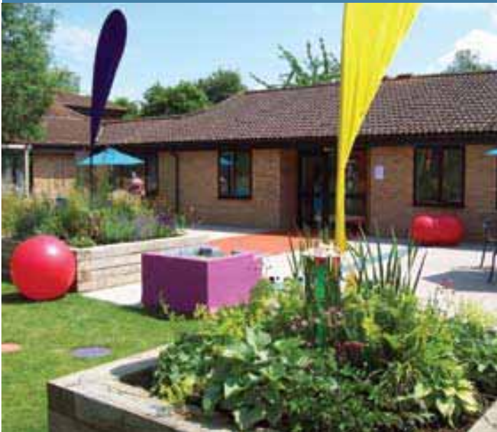
The finished project