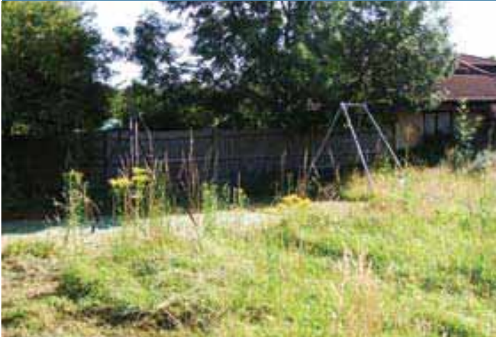
Before the project started

Offenders worked alongside volunteers to clear the overgrown gardens and create a safe, welcoming outside space at this respite care centre for children with moderate to severe learning disabilities.