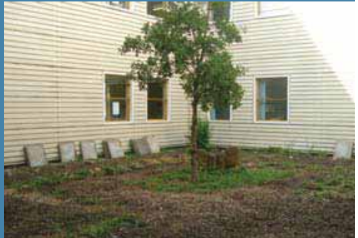
Before the project started